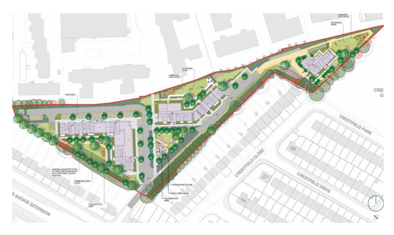
Figure 1: Site Plan of proposed development.