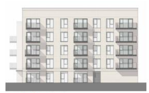
View 5: Block C West Elevation